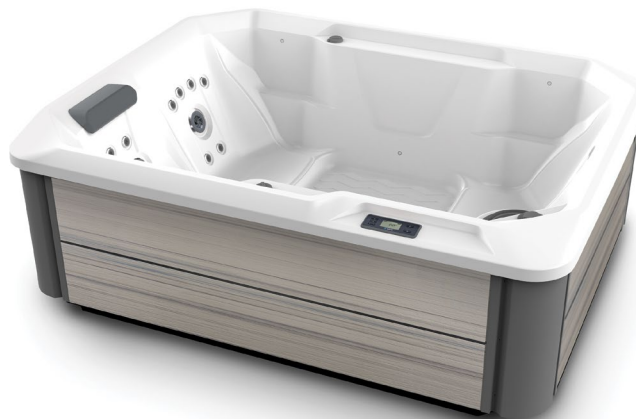
Stride spa shown with Alpine White shell and Almond cabinet.